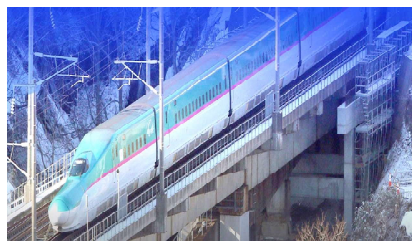
The Godrej & Boyce locks horns with Maharashtra Government over land acquisition for bullet train. A representational image.

The company in its petition has sought that the high court direct the state government to not proceed towards the award passed and initiation possession proceedings. The company in its rejoinder affidavit filed in response to the affidavits filed by the Maharashtra Government and the National High Speed Rail Corporation Ltd (NHSRCL),