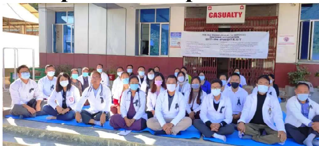
IT News Imphal, Nov 11: