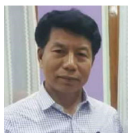
By: N. Munal Meitei

Science has established beyond doubt that the window for climate action is closing rapidly. The world's most significant climate summit, COP27 is a make-or-break moment for the global action on climate change with 198 member countries in the coastal town of Sharm al-Sheikh in Egypt, from the last Sunday, 6th to 8th November, 2022 with a view to building on previous successes and paving the way for future ambitions. Environmentalist at COP26 were clear for the countries 2030 global emissions reduction targets will cause at least 2.5°C warming by 2100. However, this is well above the target of Paris Agreement. Therefore, 1.5°C target is just like being on 'life support in ICU'.